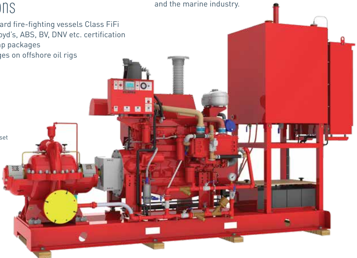
Diesel driven pump set