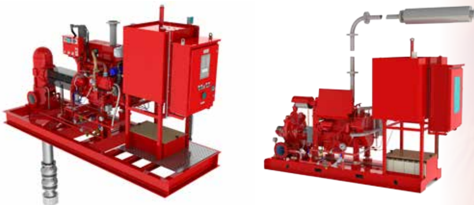
Typical Pump for an Offshore Rig

Every pump is subjected to a thorough inspection and a series of tests to ensure that it meets the required specifications before leaving the factory.